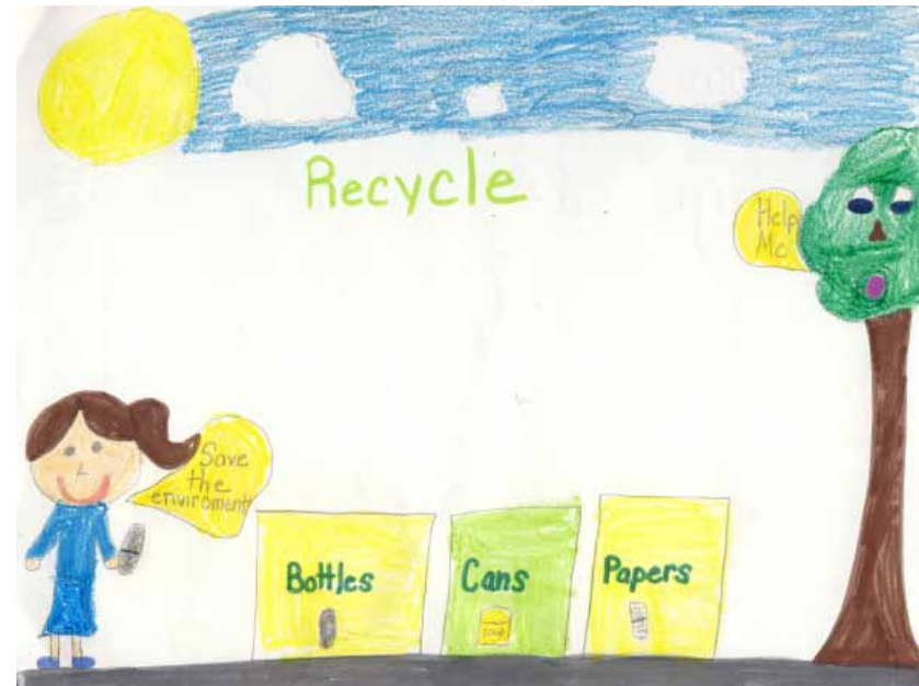
Drawing by Swetha Savanakumar